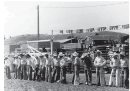
Cowboy lineup before the action begins.

The HOTR Rodeo Committee has been hard at work pulling together an event celebrating fifty years of commitment to the children who have