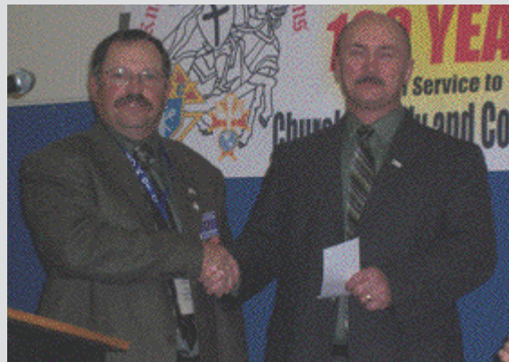
Our thanks and gratitude to the North Dakota Knights of Columbus on their 44th anniversary of the Shamrock Project. This year the