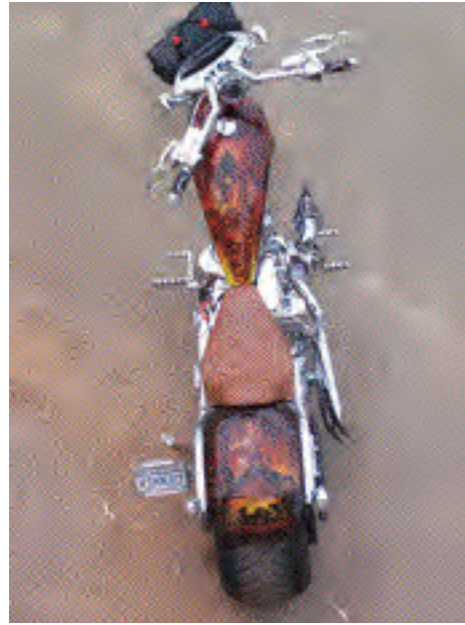
Just one of the bikes that was driven through the North Dakota Badlands during the Ride for the Range.