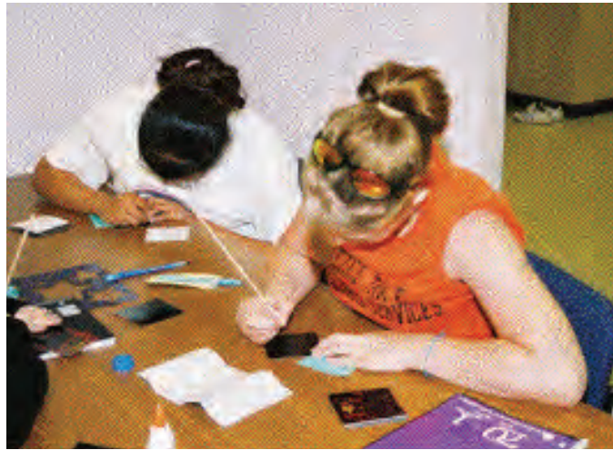
Two of the girls are working on their art projects.