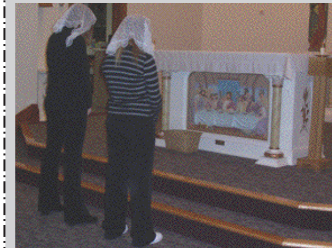
This spring two of our girls were baptized and confirmed at St. John's Catholic Church.