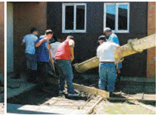
Boys and staff are busy replacing the old and broken sidewalk in front of the boys' dorm. The boys helped with concrete on other projects around Home On The Range.